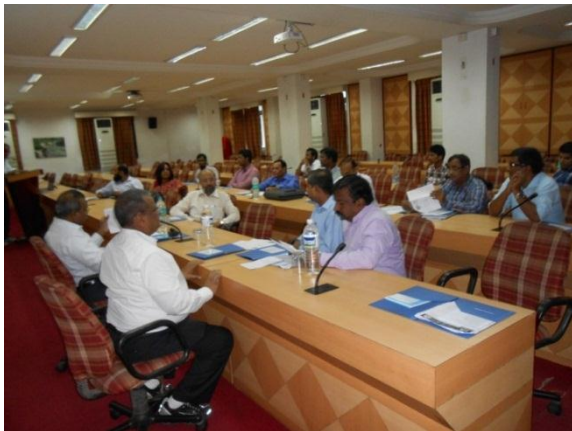
Participants of AGBM SFA Mumbai Chapter discussing road map for 2016